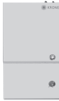
12-fibre capacity box (closed)