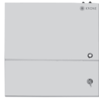
24-fibre capacity box (closed)

The fibre optic module box (FO-MB) serves as an indoor distribution point for termination of internal and/or external cables.