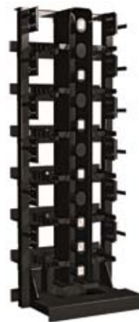
Fibre Main Distribution Frame

This frame, built for density, allows for the termination of 1728 fibres in a single frame when installed in conjunction with (12) 144-position FTB's. When used with (12) 192-position FTB's, the fibre termination count increases to 2304.