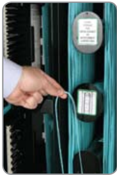
Slack Storage System

The enclosed system eliminates any crossing of jumpers, which make tracing functions much easier. The slack storage system is also designed such that stored jumpers always have positive bend radius protection to ensure signal integrity and long term network reliability. Abundant labeling on the frame and slack storage system provide guidance on cable routing dos and don'ts.