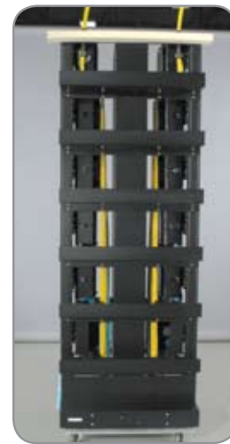
Six Rear Horizontal Cable Troughs

The FMDF frame sections are designed to ensure that all fibre jumpers are easy to route and are always protected with proper bend radius protection and physical protection. Each FMDF block mounting position includes a dedicated troughing system that incorporates complete bend radius protection at every turn and is sized to ensure easy access to fibres, even when the frame is at maximum capacity. The horizontal and vertical cable troughing within the FMDF makes the job of routing and tracing patch cords much easier by providing a clear easy to follow routing path. This easy to follow routing path reduces the number of decisions a technician has to make when routing a jumper, thus reducing the amount of time required and reducing the possibility of errors. Also, the vertical cable ways are designed with the best possible access for the technician, producing safe and easy jumper tracing.