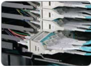
Sliding Adaptor Packs

The most basic building blocks of the Data Centre ODF are the sliding adaptor packs. These packs are the cornerstone of what makes the Data Centre ODF the ideal solution for cross-connect applications. Sliding adaptor packs house groups of fibre optic adaptors and are mounted in Fibre Termination Blocks to provide easy access to connectors, both the front and the rear connector at the same time. Sliding Adaptor Packs are available with SC and LC adaptors. The adaptors come in packs of six and eight depending on the adaptor type and the desired termination density. To access each adaptor, the pack slides neatly out of the block, still ensuring proper cable management, routing and protection.