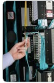
Fibre Termination Block

Fibre Termination Blocks (FTBs) house the Sliding Adaptor Packs and mount directly of the frame. These blocks are designed to ensure maximum fibre density while leaving maximum space for fibre cable management. FTBs are available with SC adaptors in block configurations of 144-positions, and with LC adaptors in 144- and 192-positions. FTBs utilise sliding adaptor packs to gain easy access to both the front and rear connectors. FTBs can be ordered with adaptors only, with factory terminated IFC stubs, or as Plug-and-Play cassettes.