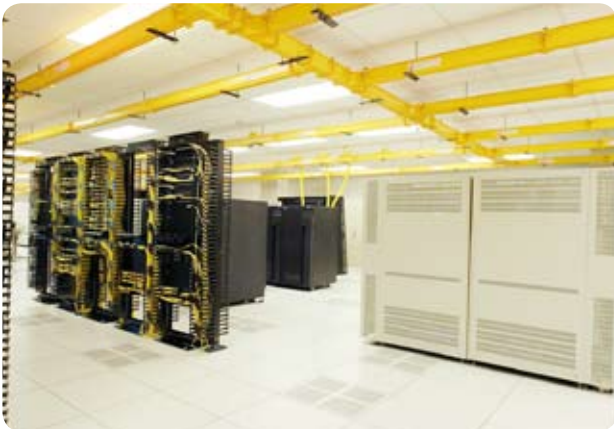
Ample Data Centre White Space

The cost to build a data centre can be upwards of $1,000 per square foot. Clearly, maximising physical space is a critical aspect of data centre design. Designers need to assess future growth potential and ensure there is a sufficient amount of space for the future. Data centres require ample areas of flexible “white” floor space that can be easily reallocated to a particular function, such as a new equipment area. Finally, room is needed to expand the data centre if it outgrows its current confines. This can be accomplished by ensuring that the space surrounding the data centre can be easily and inexpensively annexed.