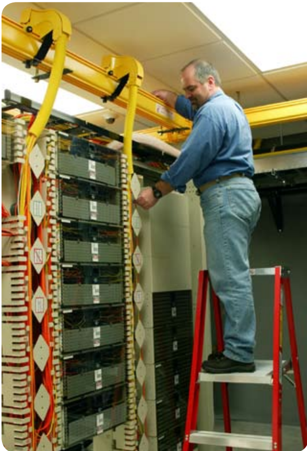
Vertical and Horizontal Cable Routing

Ample vertical and horizontal cableways are essential in maximizing the density of your data centre and supporting future growth and manageability. It's important to estimate the amount of pathway space based on fill capacity and the number of additional cables that may need to be deployed in the future. Horizontal cable tray installed both above the racks and in a raised-floor system creates a protected pathway as cable traverses between functional areas and equipment racks in the data centre. Good routing systems will provide adequate support, keep fibre separate from copper cable, protect from out-of-tolerance bends, and promote neat, easily accessible runs. Without proper routing systems, cables may hang unprotected. Exposed cables can accidentally snag, which can result in damage to the connector or cable itself. Over time, the weight of hanging fibre can also cause bends outside the acceptable limit, further damaging fibre and impacting reliability.