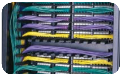
Angled Patch Panels and Cable Managers