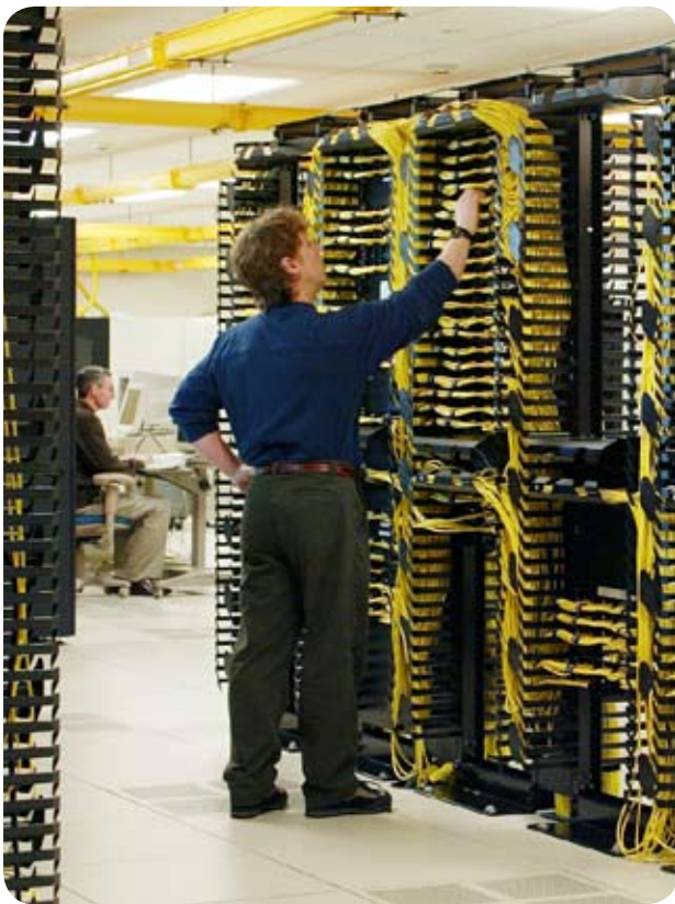
Proper Cable Management

Your network equipment can only perform as well as your cables. A gigabit port is of no value if the cable connecting that port is damaged. All cabling and connectivity within the data centre need to be deployed with proper bend radius protection, well-defined cable routing paths, room to work on connectors and cables without affecting adjacent circuits or ports, and physical protection for equipment cables, intrafacility cable, patch cords, and jumpers. Without end-to-end cable management, some of the problems encountered include cables stepped on and piled-up in raceways, maximum bend radius exceeded, difficult connector access, and hours to trace cables, all of which increases the time required to decommission hardware and bring new hardware online.