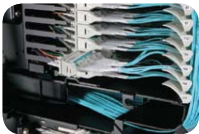
Easily Accessible Adaptors and Connectors